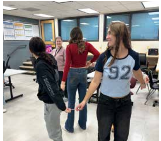
STRIVE students participating in team-building activities during the Leadership and prevention class.