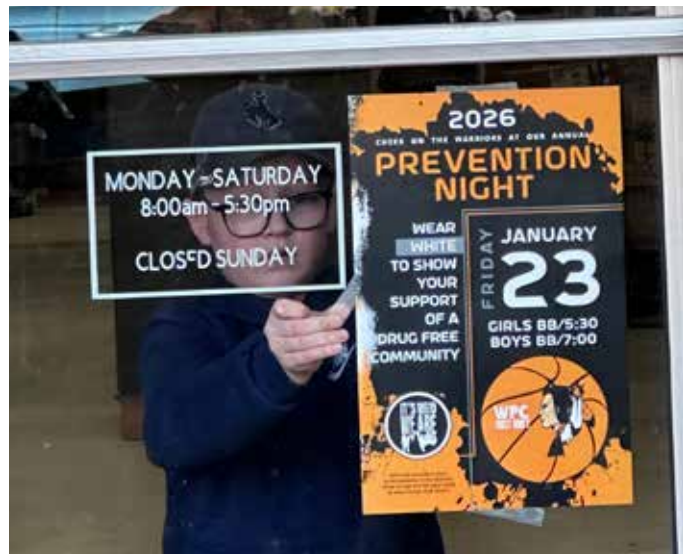
Volunteer puts up a poster for Prevention night in a local business.